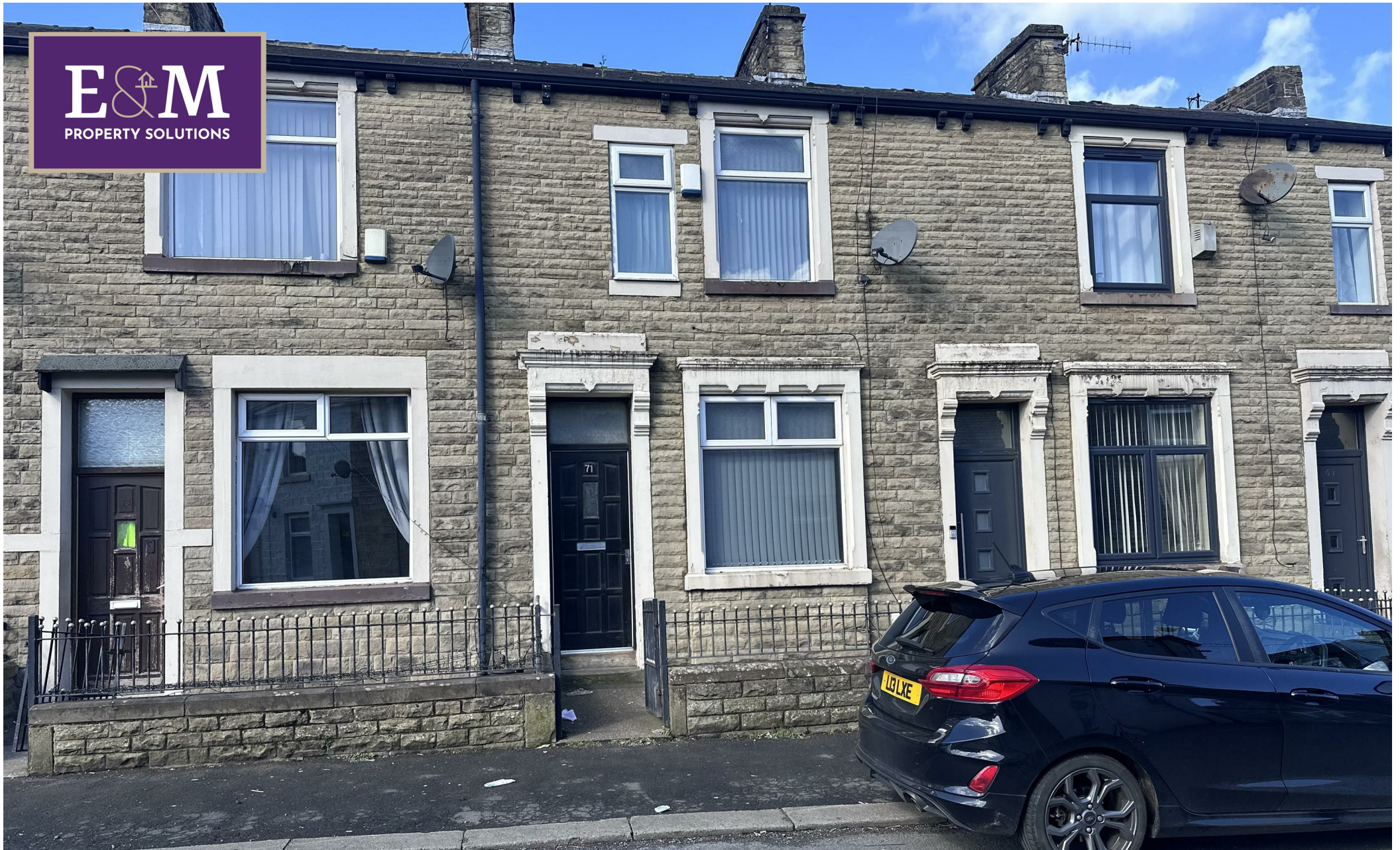
71 Coal Clough Lane, Burnley, Lancashire, BB11 4NS Asking price £115,000